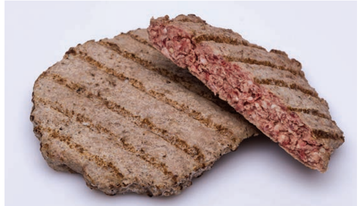
Beef burger patties, tailor-made to your demand. You tell us what equipment you use in your operation, & Rangeland Foods provides the most suitable burger patty for you. (e.g. flame-grilled patties for high volume cooking in a Combioven.)