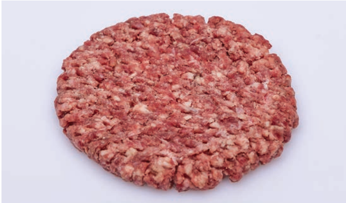
High quality beef burger patties with the taste and look of a fresh burger, produced by your local butcher. Burgers can be made of specific cuts (e.g. only whole muscle of chuck and shoulder), or cattle breed (Aberdeen Angus).