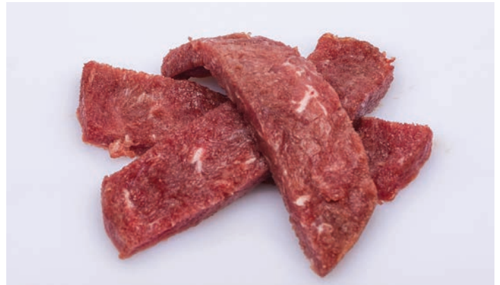
Rangeland Foods also produces beef strips for stir fries, Philly steaks, beef logs for roasting, etc.