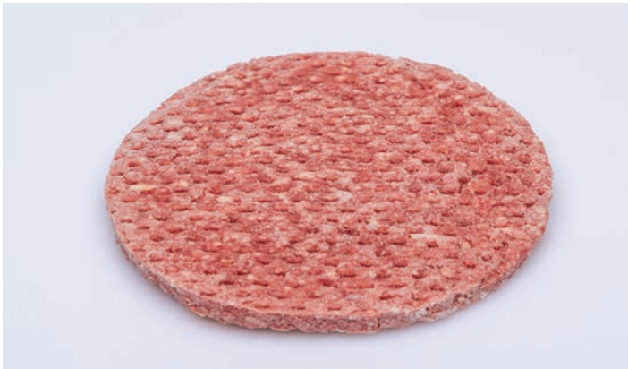
Halal: Rangeland Foods is certified to produce Halal beef burgers.