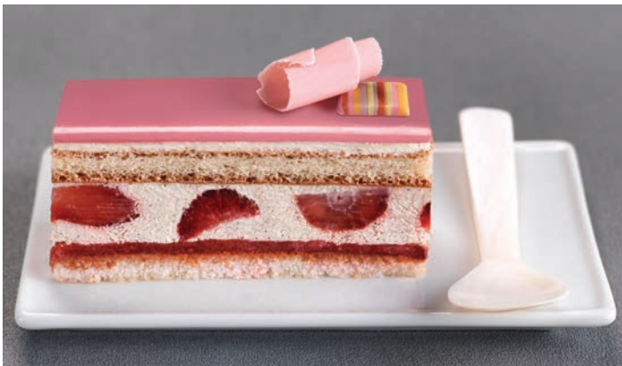
Desserts: Bandes (dessert strips), Cadres (half block desserts), individual desserts, round desserts.