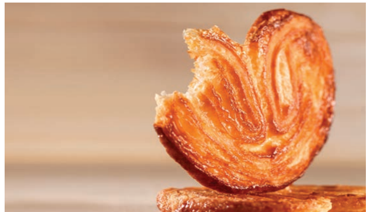
Individual snacks & sweets: Choux pastry, eclairs, Millefeuilles, ready-to-bake and fully baked products.