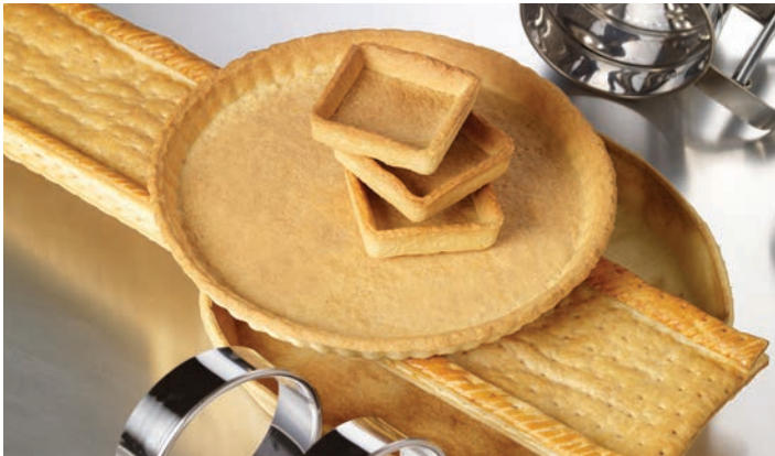
Pastry bases, strips & sheets, sponge kits: Raw bases for chefs: Sweet pastry, puff pastry, tart doughs, pizza doughs, Charlotte sponge strips & kits, Genoise sponge and joconde sponge sheets & kits etc.