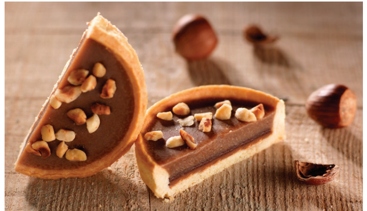
Tarts & Flans: individual and large tarts made with puff or sweet pastry; original, bold flavour flans fully baked or ready-to-bake.