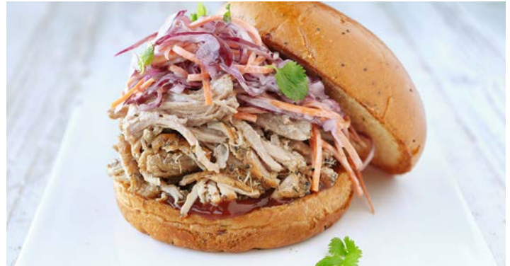
Pork: Chorizo Slices, Slow Cooked Pulled Pork, Bacon, Pepperoni Slices