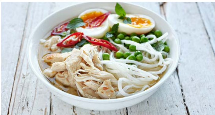
Chicken: Slow Cooked Chicken Tinga, Pulled Chicken, Roasted Chicken Strips or Dice