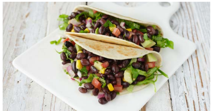
Vegan/ Vegetarian: Slow Cooked Mexican Beans, BBQ Jackfruit, Chili Sin Carne, Meat-Free Chicken Strips, Vegeroni (vegan sausage slices salami-style), Grilled Greek Cheese Slices