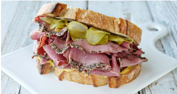
Beef: Pastrami, Sweet & Smoky Beef Brisket, Philly Beef, Meat Balls, Slow Cooked Beef Barbacoa, Taco Beef